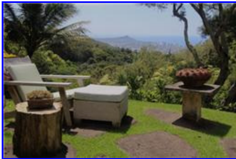
Come up to Tantalus to see what the Kama'aina have been appreciating for years.

----- Information herein deemed reliable but not guaranteed. ----- Copyright: 2012 by HiCentral MLS, Ltd. Mon, Sep 24, 2012 02:14 PM