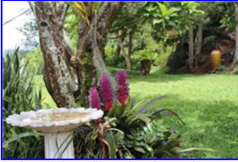
A tropical paradise and gardener's dream.