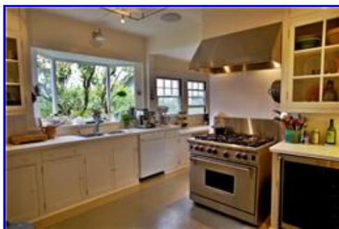
Bright and functional. Well appointed for the home chef.