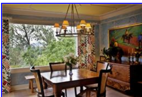
The dining room looks across to the Waianae Range.