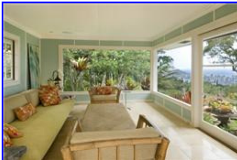
The perfect place to read a book or start an evening of entertaining.