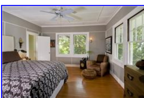
One of two master bedrooms with en suite bath.