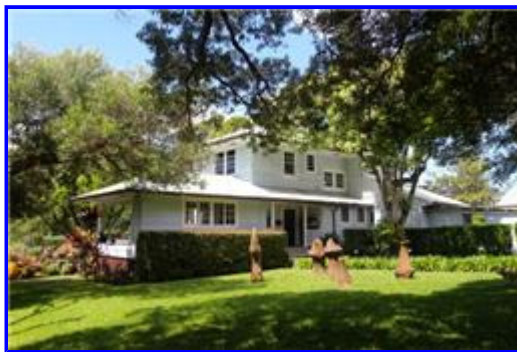
Built in 1928 and updated in 2003, this stately home has had very few owners.