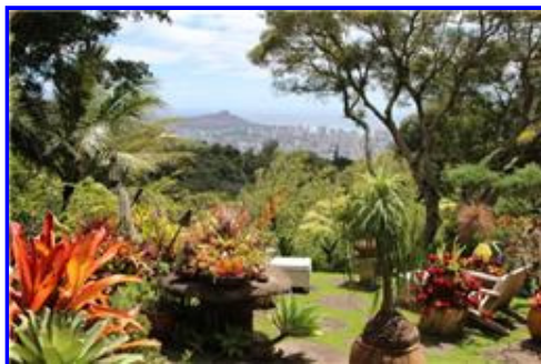
Diamond Head glows warmly in the evening twilight.