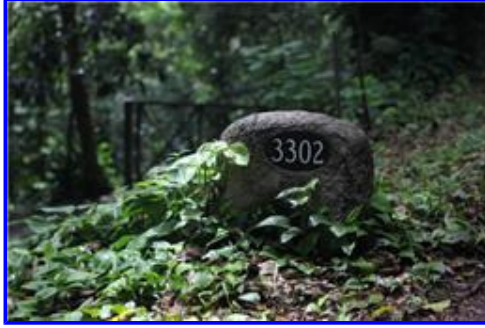
Up Tantalus drive from Makiki Heights. Easy to miss so watch on the left for this address marker.