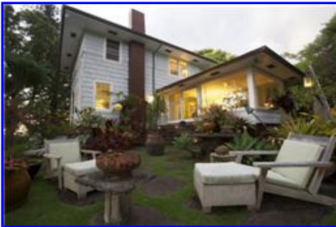
Space, privacy, views, charm, location. This home has it all!