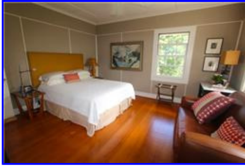
A second master bedroom or guest space overlooking the gardens below.