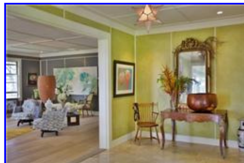
This foyer extends a very warm welcome.