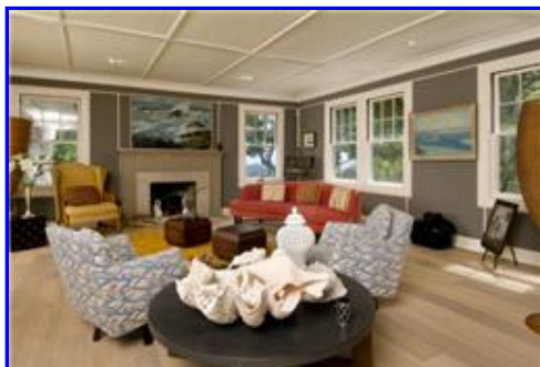
Spacious and comfortable. Elegant without being overly formal.