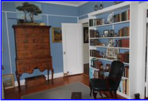
The study or guest room with a Diamond Head view.