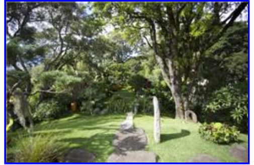
One of several garden areas in which to stroll.